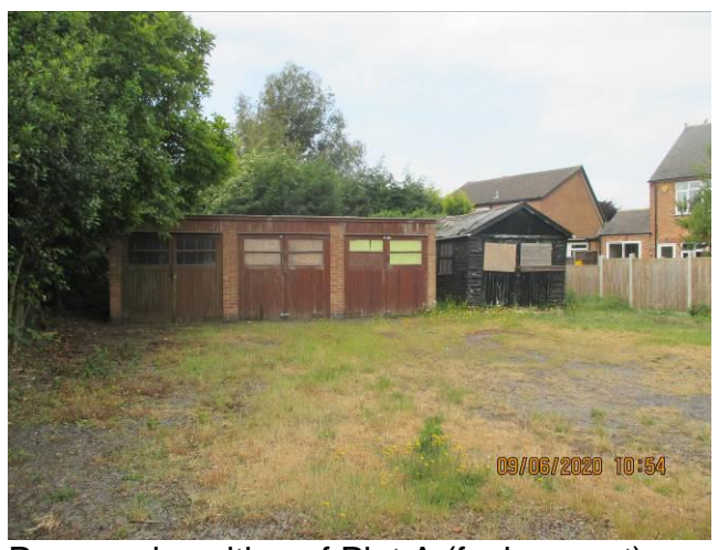
Proposed position of Plot A (facing west)