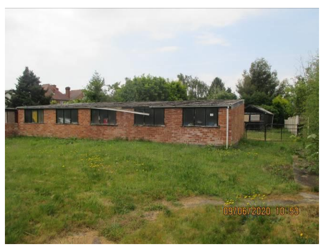
View of garages facing west