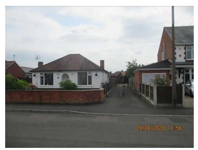
Entrance to site (no. 12 Chetwynd Road to the left and no. 10 Chetwynd Road to the right)