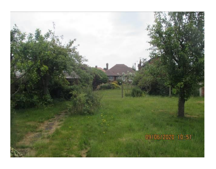
View of no. 13 Rutland Avenue facing south