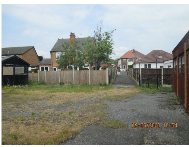
No. 10 to the left and no. 12 to the right (facing north)