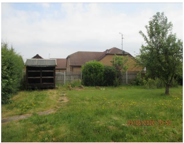
Proposed position of Plot C, side elevation of no. 5 Anfield Close